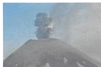
Kamchatka's landscape speaks for itself - It is riddled with volcanoes, thirty of which are active.

Luckily, just beyond the capital's drab neighbourhoods the landscape soon reverts to nature. A human population of 321,000, mostly concentrated in the city, still allows for huge tracts of road less wilderness (11.58% of Kamchatka's total 472,000 km 2 is rigorously protected). By helicopter, the principle mode of transport beyond the very sparse road network, one discovers a lyrical landscape of smoking or lacustrine volcanic craters, tundra dappled with large patches of ice even in these very warm August temperatures, dense forest between which flow the silver ribbons of rivers, streams and cascades. Here roams the Kamchatka brown bear, seemingly as ubiquitous as pigeons in Venice and the object of constant warnings to not wander off alone, (Vladimir Mosolov, Science Director of Kronotsky Federal Nature Biosphere Reserve puts their total population at 10,000).