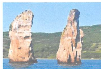
Tirhaia cove has marine grottos coloured turquoise by the sunset, carpets of greenery under rune-like birch trees, teaming rookeries on offshore islets, 'spy-hopping' seals.